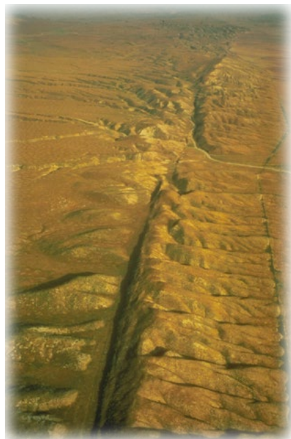
Extraída de: Aerial view of San Andreas fault (2011).